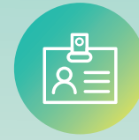
ID Management iBoT