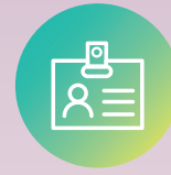
ID Management iBoT