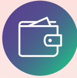
Accounts Payable iBoT