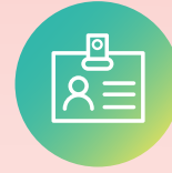
ID Management iBoT