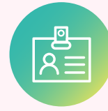
ID Management iBoT