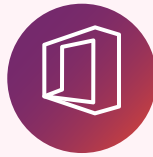
Office 365 iBoT