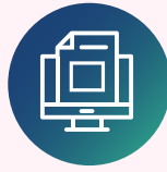
Data Entry iBoT