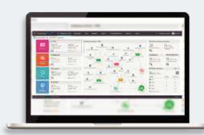
BUSINESS SERVICES VIEW