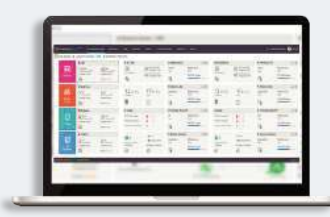
BUSINESS FUNCTIONS & INFRA OBJECTS VIEW