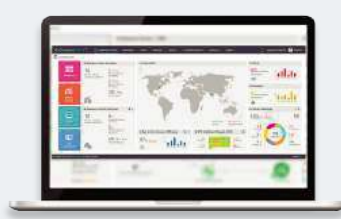
UNIFIED CXO DASHBOARD