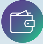
Accounts Payable iBoT