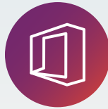
Office 365 iBoT