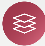
Sugar CRM iBoT