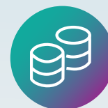
Data Clearance iBoT