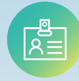
ID Management iBoT