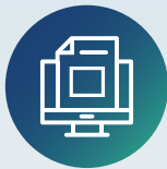
Data Entry iBoT