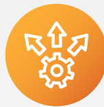
SFDC CRM iBoT