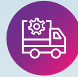
Supply Chain iBoT