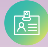
ID Management iBoT